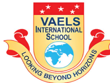
VAELS International School Chennai